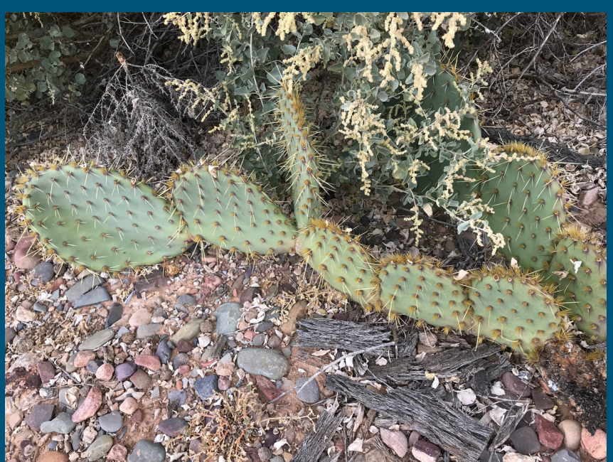
Pictured above: Examples of Cylindropuntia fulgida and Opuntia englemannii in the old town.