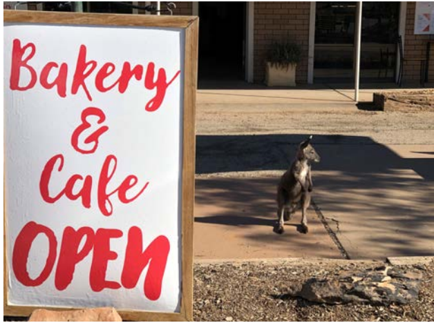
Word of Jimmy's fabulous pies has got around so much so that even the local wildlife are hopping in, hoping for a taste!