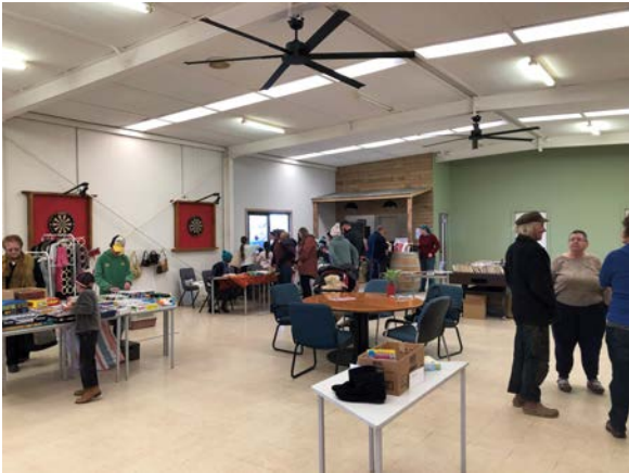
The first of what promises to be many - the Copley Market was held on the last Saturday in June