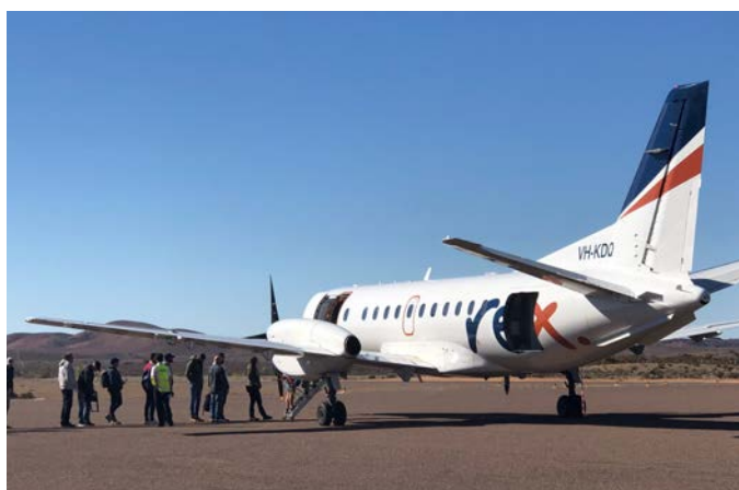
Leigh Creek Aerodrome has been a hive of activity with the SA Water Pipeline workers flying in and out and many other visitors too.

Changes to the the Leigh Creek Dump opening times will now be: Saturday 10am - 2pm Tuesday 10am - 2pm