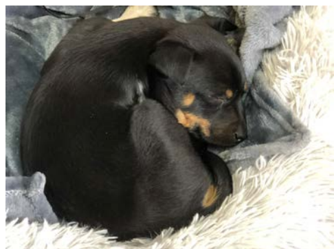
Friday 25th June was Take your dog to work day - Introducing Missie Bowshire

Also try to avoid disposing of ash in waste bins. Consider a garden bed or another safe outdoor location for disposal. Another tip is to make sure your fireplace chimney is clean and it's properly ventilated.