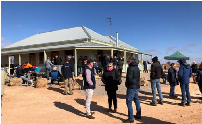
Patterson's House pictured below as guests were waiting for the opening