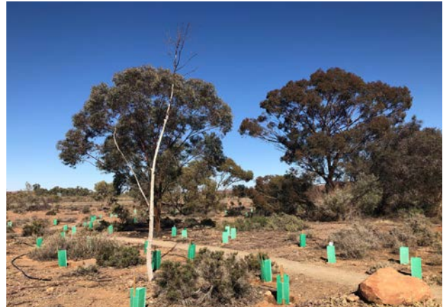
The Copley Progress Association have been busy planting trees near the Information Bay