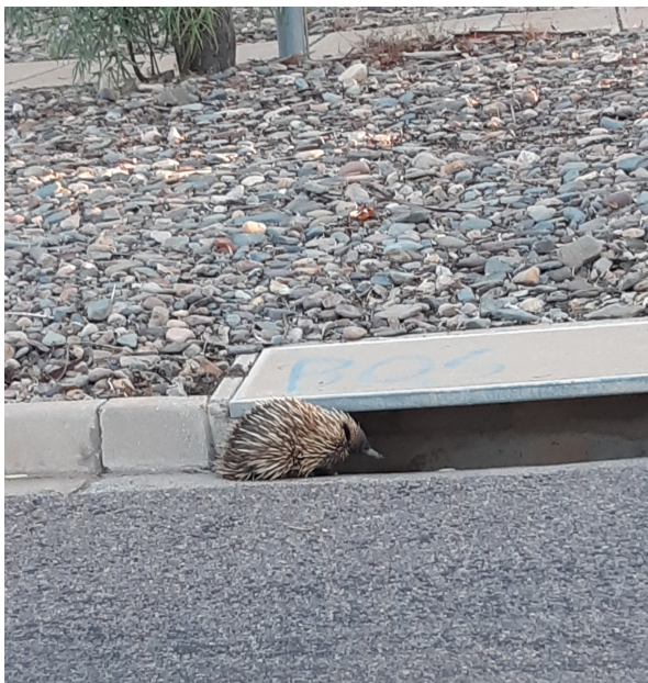
A little local found wandering around town