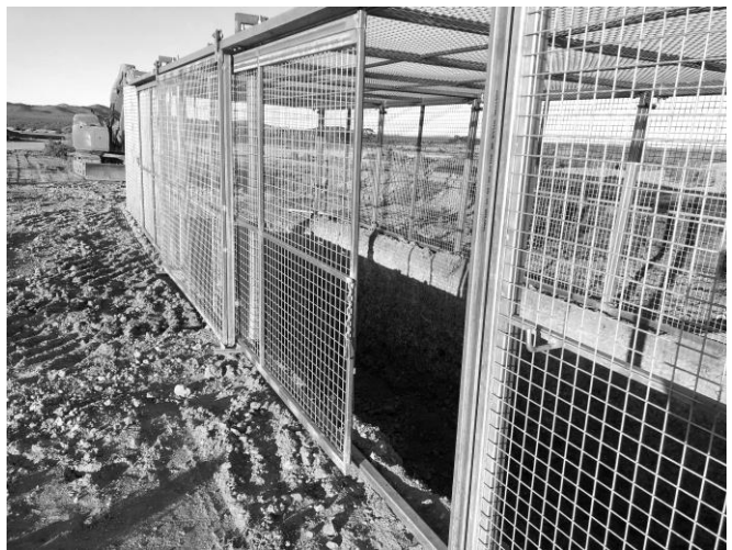
The new cage has been sited over the future household rubbish pit, in a bid to retain all rubbish in the confined area.

www.landscape.sa.gov.au/saal/news-resources/media-releases